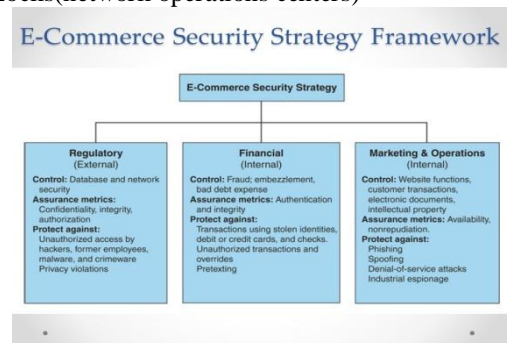
Fig3. E-Commerce Security Strategy [12]